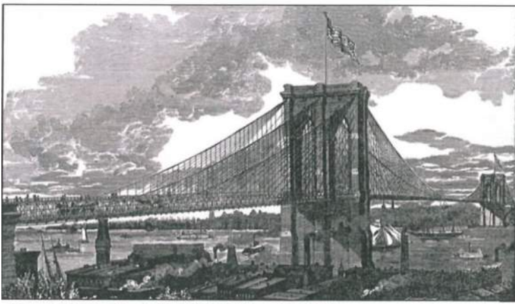
Figure 3. The Brooklyn Bridge (Scientific American 1877)

In 1872, Eads and Roebling, two well-known and highly respected civil engineers, became associated with a well-publicized quarrel. The root of this disagreement was the design of the caissons used in the construction process, as each engineer claimed to be the first person to have designed the caisson structure used to lay the bridge foundations. The argument between Eads and Roebling, a back-and-forth series of articles written by the engineers and published in journals, survives today given the public forum in which this dispute took place.