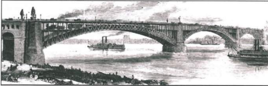
Figure 2: The St. Louis Bridge built by James Eads (Williams 1877)

The St. Louis Bridge, built by Captain James Eads in 1874, and the Brooklyn Bridge, completed by Colonel Washington Roebling in 1883, shared innovative techniques and established precedents for designing long-span bridges in the years ahead. Both used methods and designs that challenged engineering preconceptions. Pneumatic caissons were used to reach the riverbed to secure the bridge foundations, and daring long-span designs defied previous building standards.