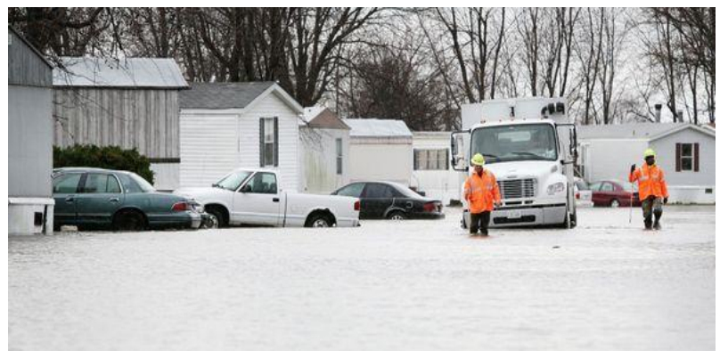
Workers with Ameren Illinois shutting off gas lines