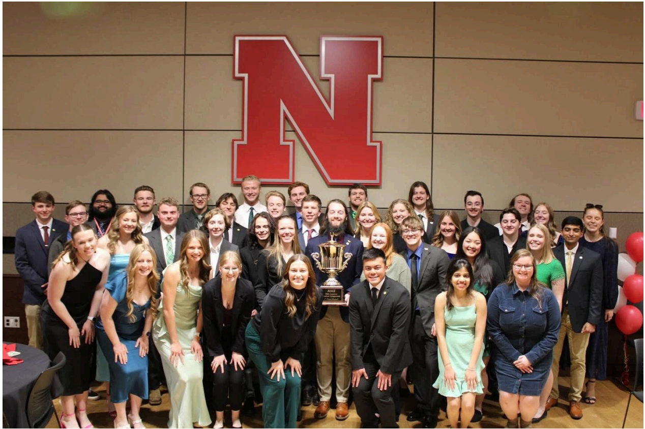
Missouri S&T students pose with the symposium trophy at the ASCE Mid-America Student Symposium.