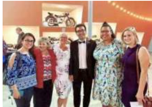
A few of our YMs with a couple past Section presidents.