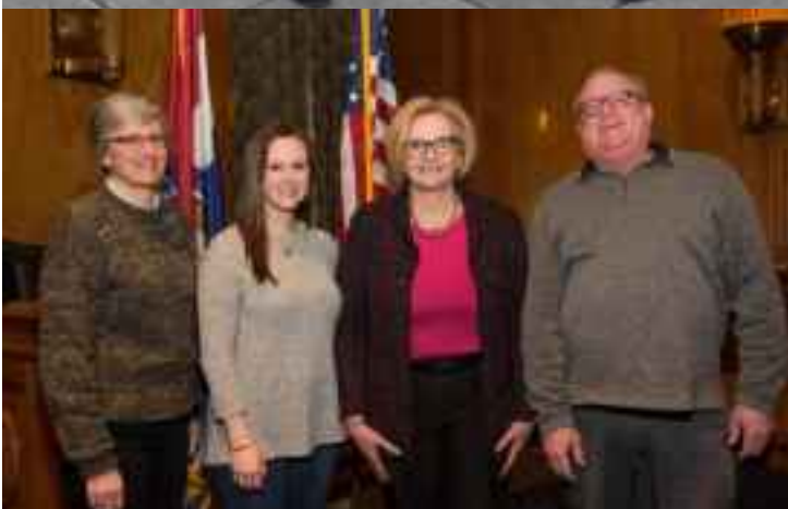
Left: MO ASCE Members with Senator Claire McCaskill