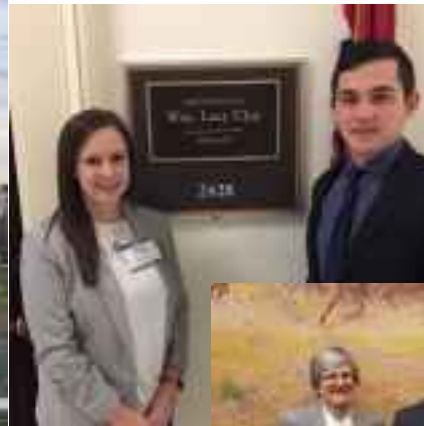
Left/Below: MO ASCE Members with staffers from Rep. Lacy Clay, Sen. Roy Blunt, & Rep. Ann Wagner